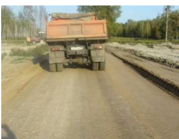
Finished surface with gravel - bitumen layer is missing