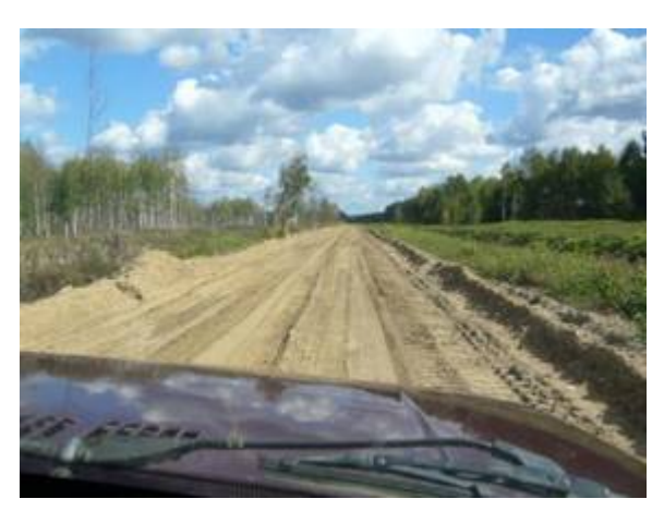
Applying very clayey material> 30% clay (0.002 mm)