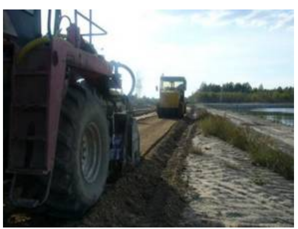
Compacting with rubber wheel and smooth drum roller